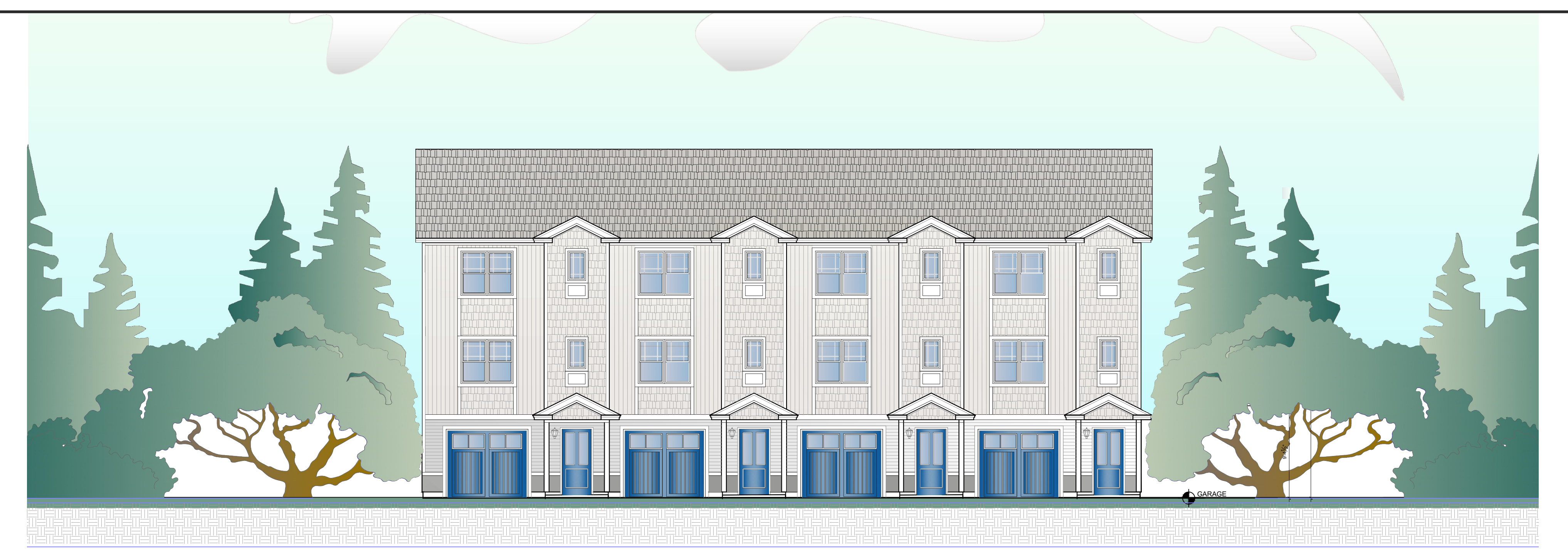
FRONT ELEVATION BUILDING 1-A