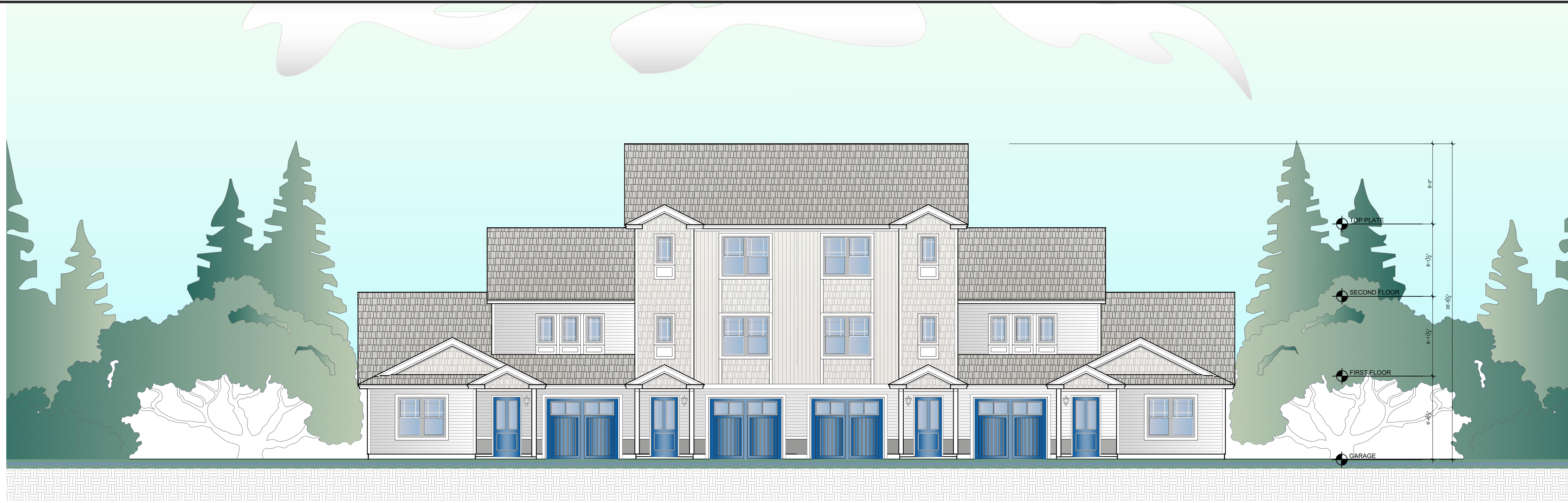
FRONT ELEVATION BUILDING 1- B