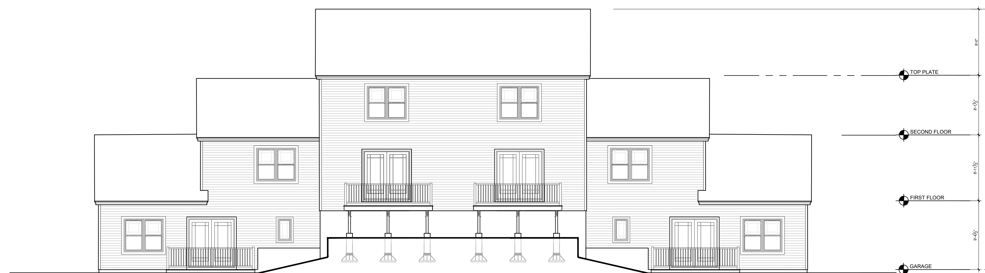
BACK ELEVATION BUILDING 1- B